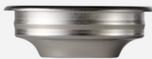
58mm Filter basket(single cup)