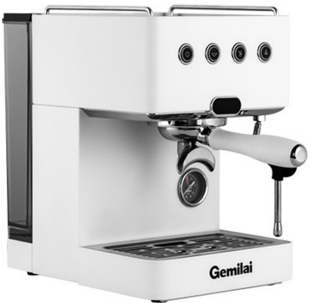
Left 45° view