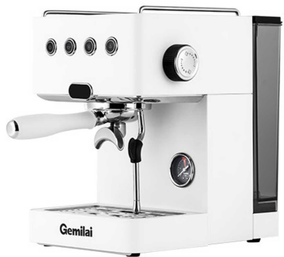
Right 45° view