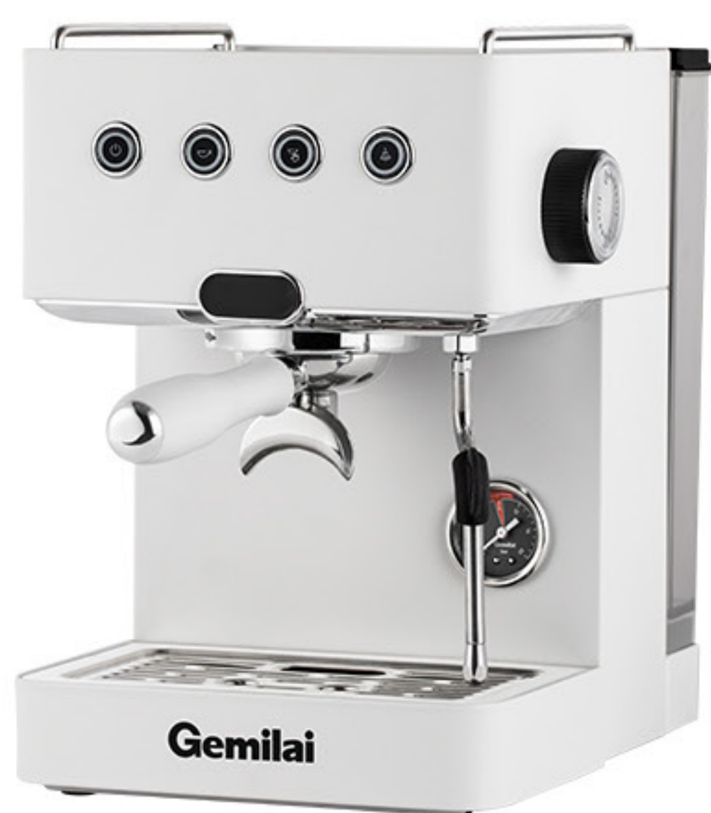
Cotton Cloud White