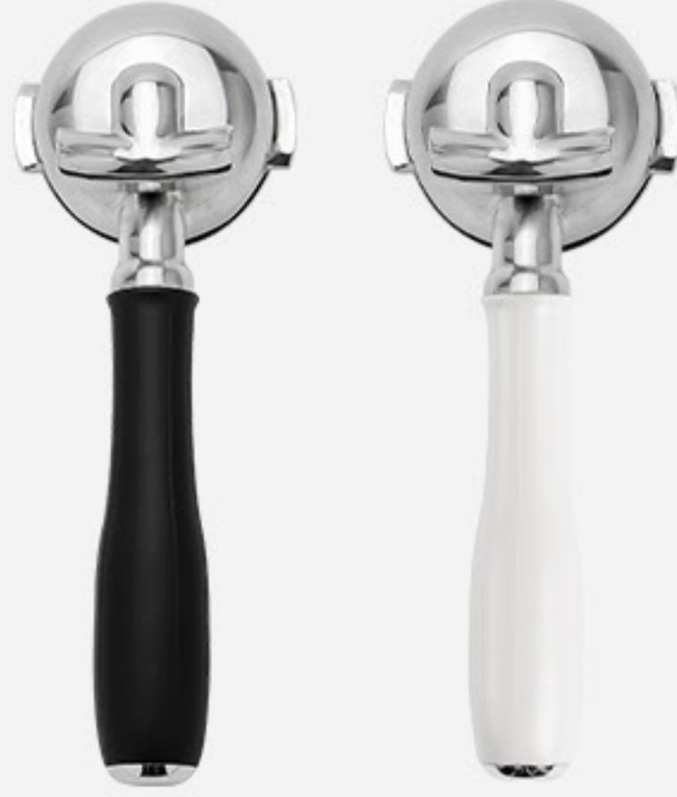
Plastic Portafilter (Double Cup)

*Color of the handle and the machine are consistent